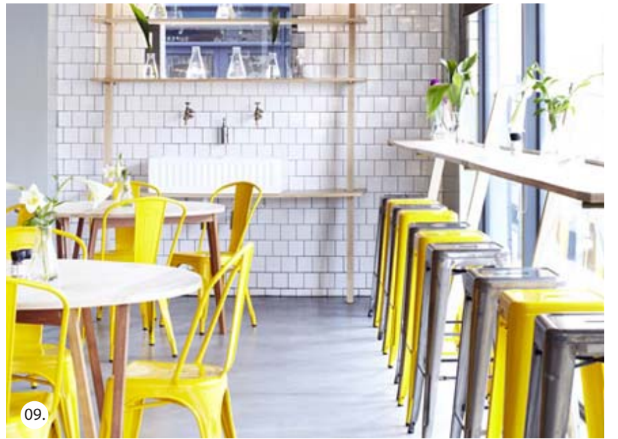
01. PLY CLAD SEATING & PENDANTS LIGHTING OVER 02. PIN BOARD MENU WITH WHITE ACRYLIC PUSH FIT LETTERING 03. BUILT IN BENCH SEATING & UPHOLSTERED CUSHIONS 04. TIERED DONUT GLASS DISPLAY 05. PLY CLAD COUNTERFRONT 06. WHITE NEON BRANDING 07. UNIFORMS 08. RECONSTITUTED STONE COUNTER TOPS 09. COLOURFUL FURNITURE 10. GELATO DISPLAY 11. ROUNDED TIMBER TABLE TOPS